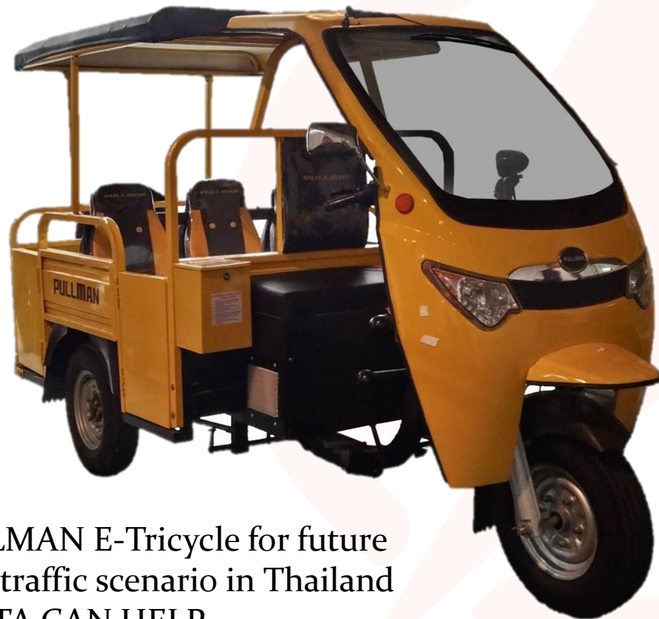
PULLMAN E-Tricycle for future local traffic scenario in Thailand # AFTA CAN HELP