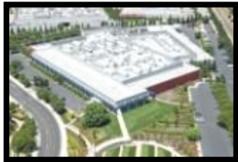
San Jose CA